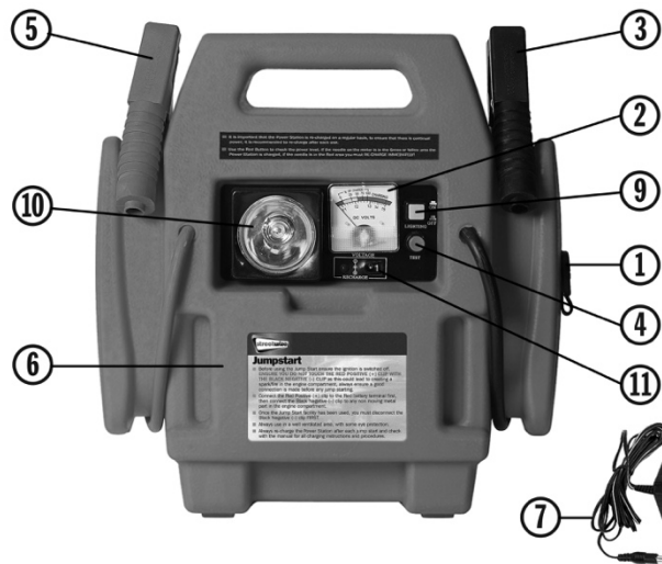
Figure 1. SWPP9 & SWPP10 Front view showing control panel