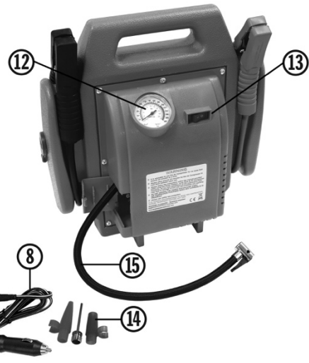
Figure 2. SWPP9 (ONLY) with Air Compressor