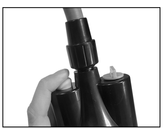
3. To turn on, press button on pump. (Pressing this button again, will also switch the pump off.)